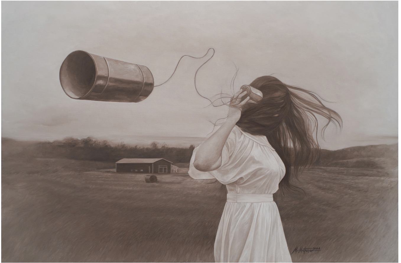
Re-Connect Oil on Canvas 24 x 36 Inches 2024